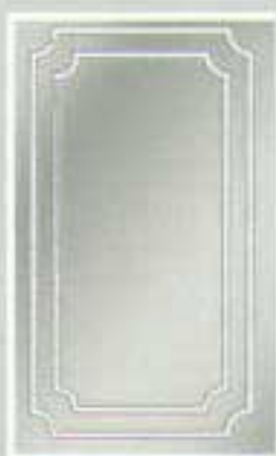
Border Style 3