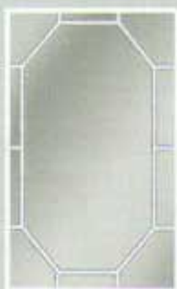
Border Style 1