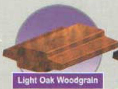
Light Oak Woodgrain