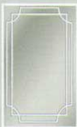
Border Style 2