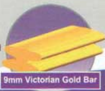
9mm Victorian Gold Bar