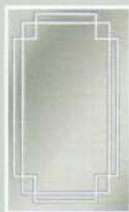
Border Style 4