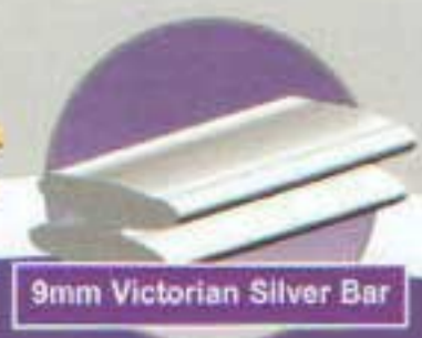
9mm Victorian Silver Bar