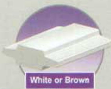
White or Brown

When ordering Georgian bar units unless you quote the thickness of the bar and colour, 18mm white will be supplied as standard.